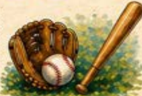
PICKUP SOFTBALL GAME