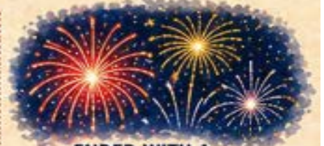
ENDED WITH A FIREWORKS SHOW from Going Ape Fireworks