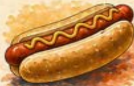
HOT DOGS FROM HENRY'S DINER